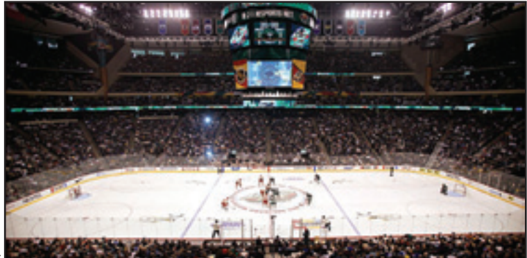
The puck dropped for the 2004 NHL All-Star Game at the Xcel Energy Center.

Across the street at the Xcel Energy Center, the NHL All-Star Game was played on the home ice of the Minnesota Wild, which features one of Athletica's latest rink innovations, the GlassFlex impact-absorbing shielding system. Manufactured to address the stiffness of seamless glass during aggressive play, the GlassFlex system allows movement of the dasher board shielding on impact through a patented clip and channel system. Athletica's GlassFlex earned NHL approval for use in its arenas by demonstrating through a series of engineering tests that the GlassFlex system is up to 55% more flexible than supported acrylic systems.