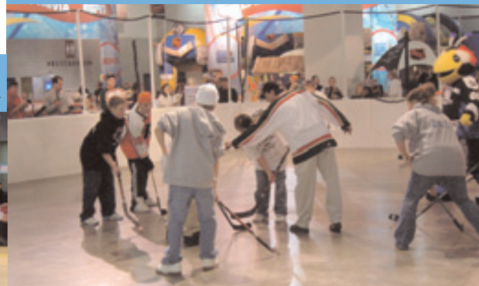
Athletica installed two small (60' x 40') GamePlex rinks directly onto the finished concrete floor of the RiverCentre for the Street Hockey area.