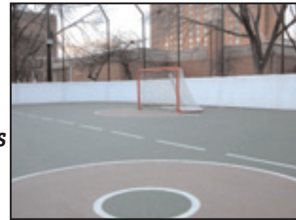
Location, Location, Location Installed in a campus residential hall area, the rink has attracted user interest from the moment installation was complete.