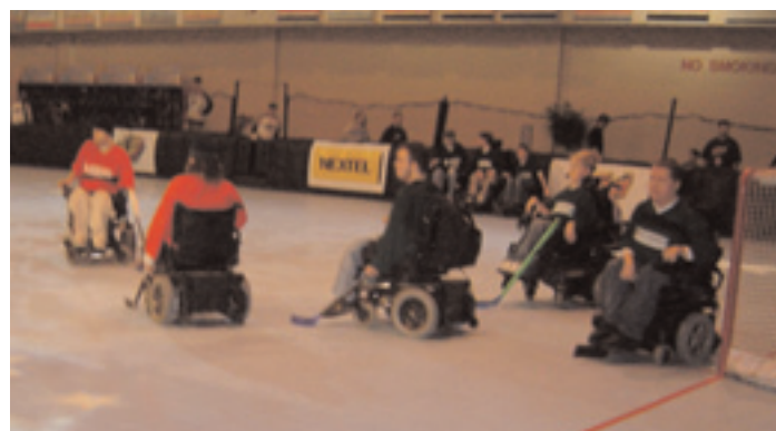
The NHL COOLAir inflatable rink system was utilized for everything from in-line hockey to wheelchair hockey games.