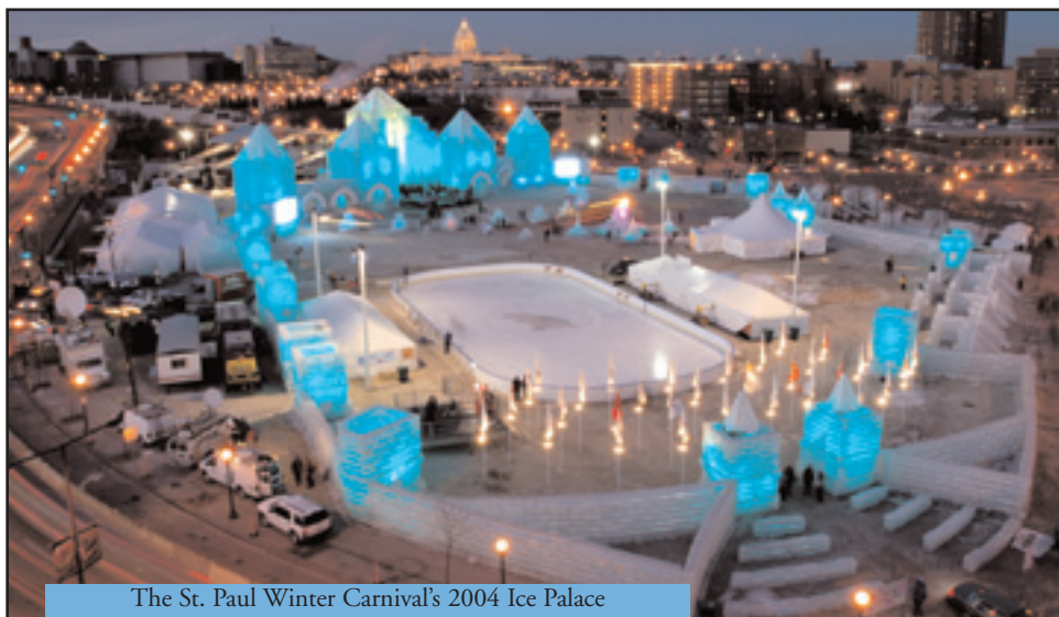
The St. Paul Winter Carnival's 2004 Ice Palace incorporates an outdoor ice rink from Athletica